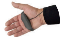
SV 105F Tri-Axial Hand-Arm Vibration Accelerometer with Force Detection