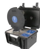
SV 111 Hand-Arm and Whole-Body Vibration Calibrator