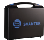
SA 146 Carrying Case for SV 106D and accessories