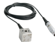
SV 151 Tri-Axial SEAT Vibration MEMS Accelerometer