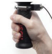
SV 150 Tri-Axial Hand-Arm Vibration MEMS Accelerometer