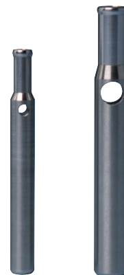
Geopump™ Tubing Weights