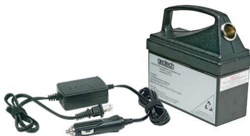
Geopump™ Modular Battery and Charger