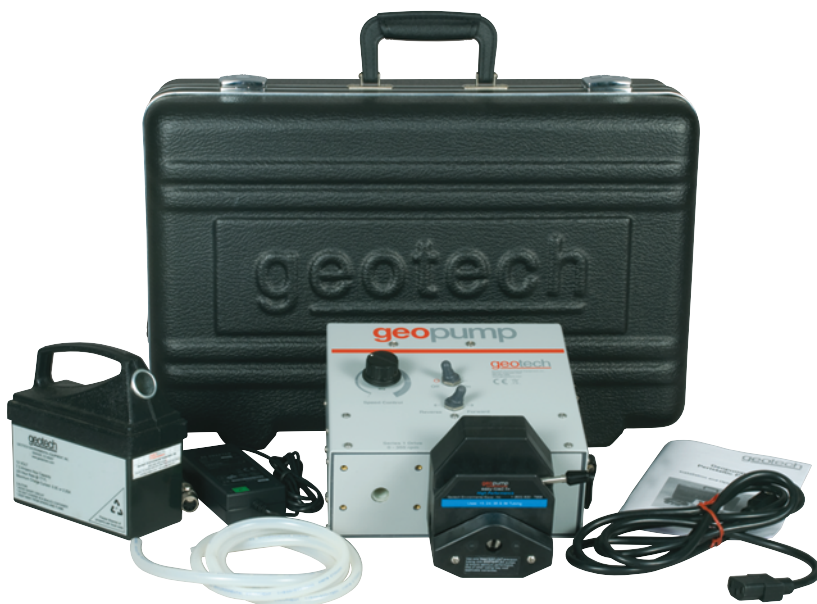
Geopump™ Peristaltic Pump Series II Kit with optional easy-load II® pump head, modular battery, 5 ft. (1.5 m) tubing, carrying case and power cord