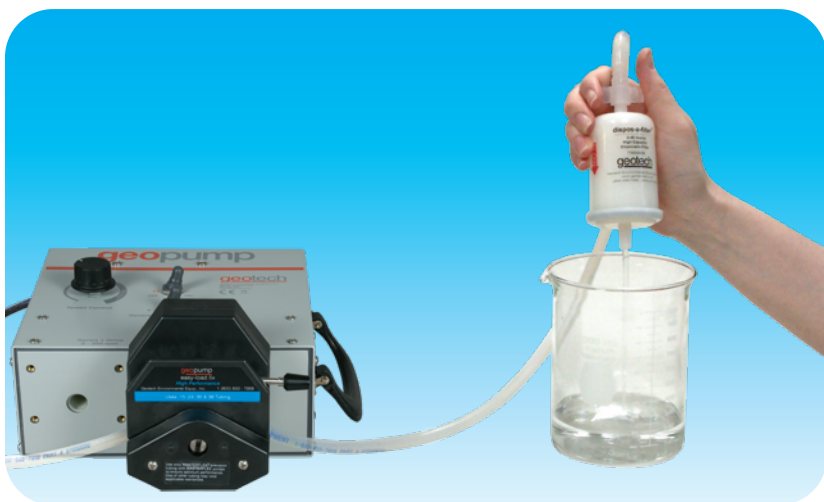
Sample collection with the Geopump™ Peristaltic Pump Series II with optional easy-load II® pump head (dispos-a-filter™ capsule sold separately)