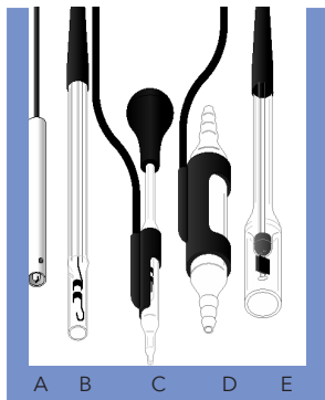
3200 series cells with built-in temperature sensors (see chart on back)

The YSI 3100 provides high-accuracy measurements for basic conductivity. Includes direct-reading digital display, adjustable temperature coefficient, and automatic temperature compensation.