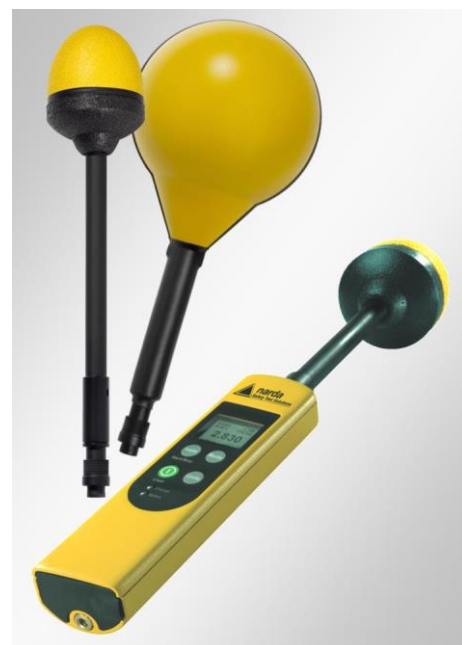
Changing the probe is quick and easy, with no need to reconfigure the device