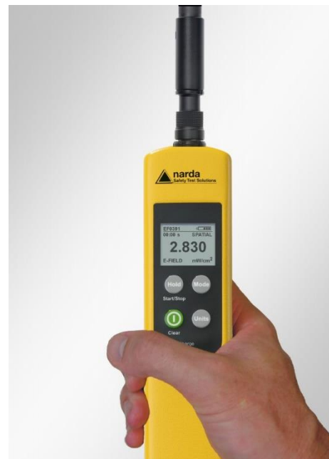
Small, lightweight and rugged design – ideal for use in rough environments