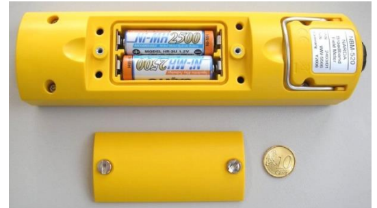
The battery compartment is opened easily using a coin. Two replaceable NiMH rechargeable batteries (AA size) are used to power the device.