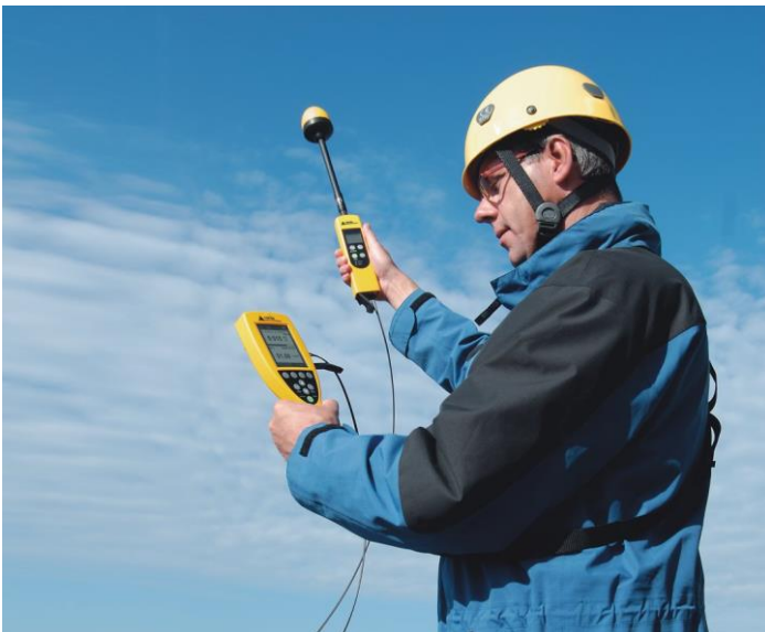
Probe extension using an optical cable: The NBM-550 acts as controller and displays the results. The smaller NBM-520 acts as the optical probe interface. Both devices can also be used separately as measuring devices when fitted with probes.