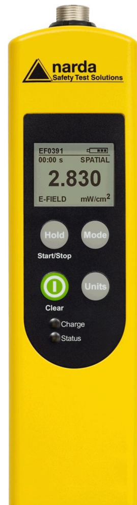
Narda Broadband Field Meter NBM-520

▲ Auto zero ensures precision measurements