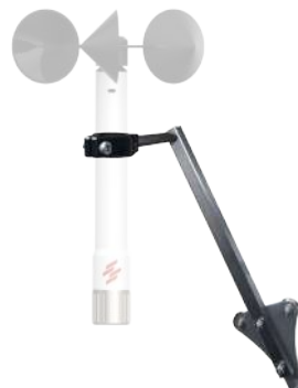
Magnetic Sensor Mounting Bracket