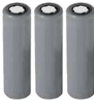
AA Battery x 3 (for Receiver)