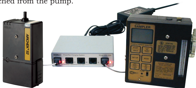
Five-station PowerFlex charging the AirChek 52 and Universal PCXR8

Pump-specific cables are used to connect battery packs to the PowerFlex. Simply plug the appropriate cable into a PowerFlex port and plug the other end into the appropriate pump charging jack. An LED indicates charge mode. PowerFlex charges most battery packs within six hours and automatically switches to a safe pulse trickle charge when full charge is detected. Each attached battery pack runs through an independent charge cycle. Battery packs can be charged either attached to or detached from the pump.