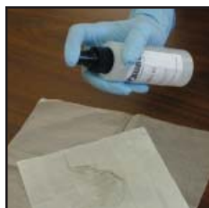
Aim at soiled wipe and depress nozzle 3 times.