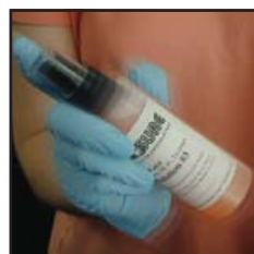
Shake well to mix.