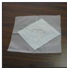
Place wipe, sample side up, on waxed paper.