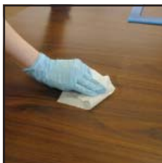
Wipe surface area horizontally, then vertically using one side of wipe.