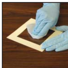
Use a template to specify sample area for samples to be sent to a lab.

Use a new pair of clean gloves for successive wipe samples.