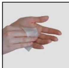
Wipe hands or skin for 30 seconds using one side of wipe.