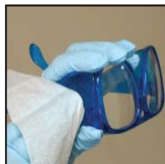
Wipe safety glasses, phones, shoes, etc. thoroughly using one side of wipe.

When taking surface samples that are to be sent to a laboratory for analysis (Lab Analysis Kit) use a template to specify the sample area.