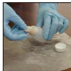
Insert in sample collection bottle and label.