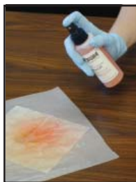
Aim at soiled wipe and depress nozzle 2 times.