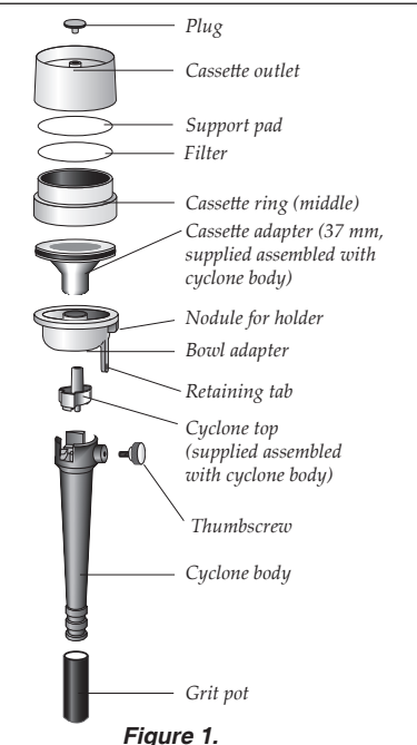
GS-1 Cyclone with standard 37-mm cassette installed - exploded view

The GS-1 Cyclone is a 10-mm lightweight conductive plastic sampler with single inlet designed for use with either a Diesel Particulate Matter (DPM) Cassette or a standard three-piece 37-mm cassette and filter (25 mm with adapter accessory) for collecting respirable dust particles. The GS-1 Cyclone conforms to the ISO 7708/CEN criteria of a 4-µm 50% cut-point at 2 L/min with minimum bias (see References). The cyclone may be operated at 1.7 or 2 L/min to meet MSHA DPM sampling requirements or at 3 L/min for a 3.5-µm cut-point to meet the MSHA for silica standard. The GS-1 Cyclone is supplied with 37-mm cassette adapter, bowl adapter, and grit pot.