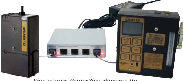
Five-station PowerFlex charging the AirChek 52 and PCXR8

Pump-specific cables are used to connect battery packs to the PowerFlex. Simply plug the appropriate cable into a PowerFlex port and plug the other end into the appropriate pump charging jack. An LED indicates charge mode. PowerFlex charges most battery packs within six hours and automatically switches to a safe pulse trickle charge when full charge is detected. Each attached battery pack runs through an independent charge cycle. Battery packs can be charged either attached to or detached from the pump.