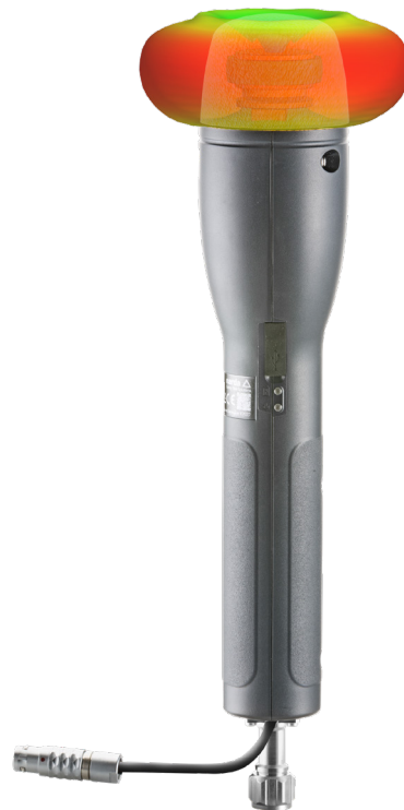
Fig. 2. 3591/02 Omnidirectional