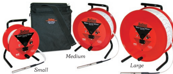
Model 101 Water Level Meter Reels

* Polyethylene tapes are only available in these lengths